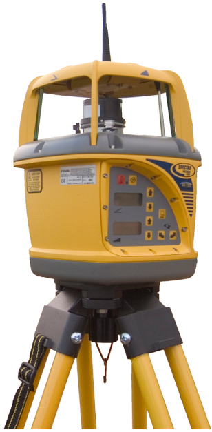
GL722 Grade Laser

For the GCS900 2D AND For the GCS900 3D with Laser Augmentation