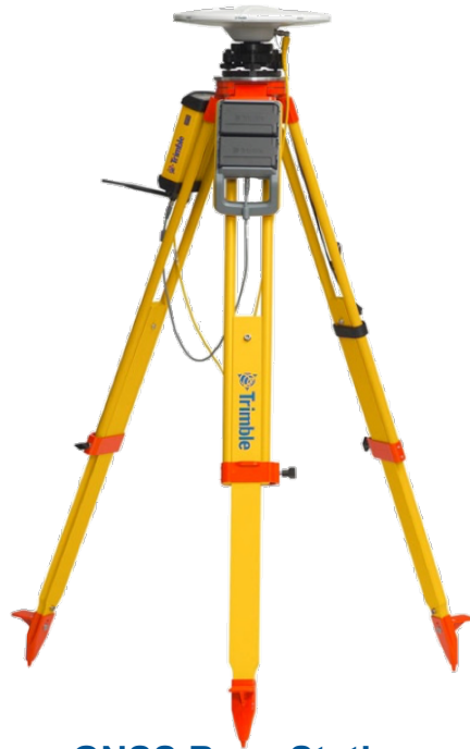
GNSS Base Station

For the GCS900 3D with GNSS OR GNSS and Laser Augmentation