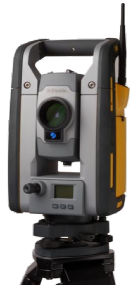
Universal Total Station